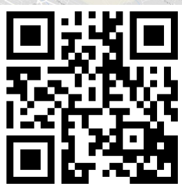
[ map of University's key locations ]